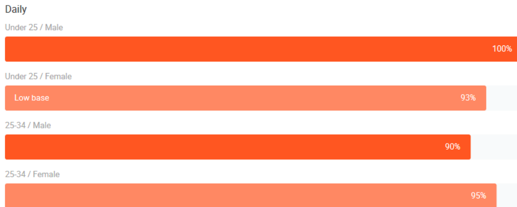
Figure no. 1. Daily usage of Internet for users under 35 years old (www.consumerbarometer.com)

Connected Consumer Survey 2017 (thinkwithgoogle.com, October, 2018) as well as the the Consumer Barometer Survey 2014/2015 that was generated with the answered from 2832 individuals.