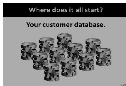
Figure no. 2 - Consumer /customer database