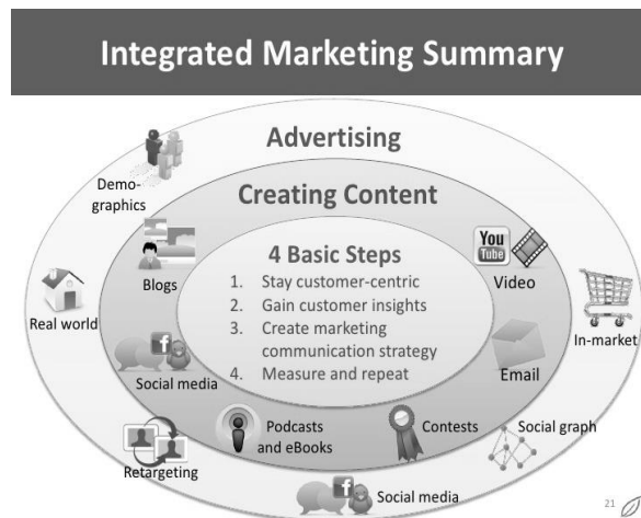
Figure no. 3 – Integrated marketing communication

Integrated Marketing Communication is a “transfunctional process that the companies use to create and maintain profitable relations with the clients and strategically interested parties, which control/influence all the messages sent to these groups, encouraging a dialogue meant to obtain an increase of the brand value “ (Duncan T., 2002, quoted in D. Tănăsescu et al., 2014) and allows an active and respectively proactive adaptation to the enterprise’s initiative of modifying its marketing offer through the use of “new media” in order to build its presence on the Internet (fig. no. 3).